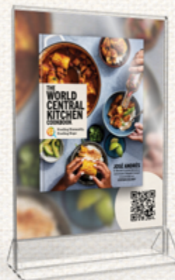
TABLETOP AND EASEL-SIZED EVENT SIGNAGE Add some context and fun visuals to your event!