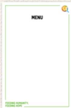
EVENT MENU Let your guests know what to expect!